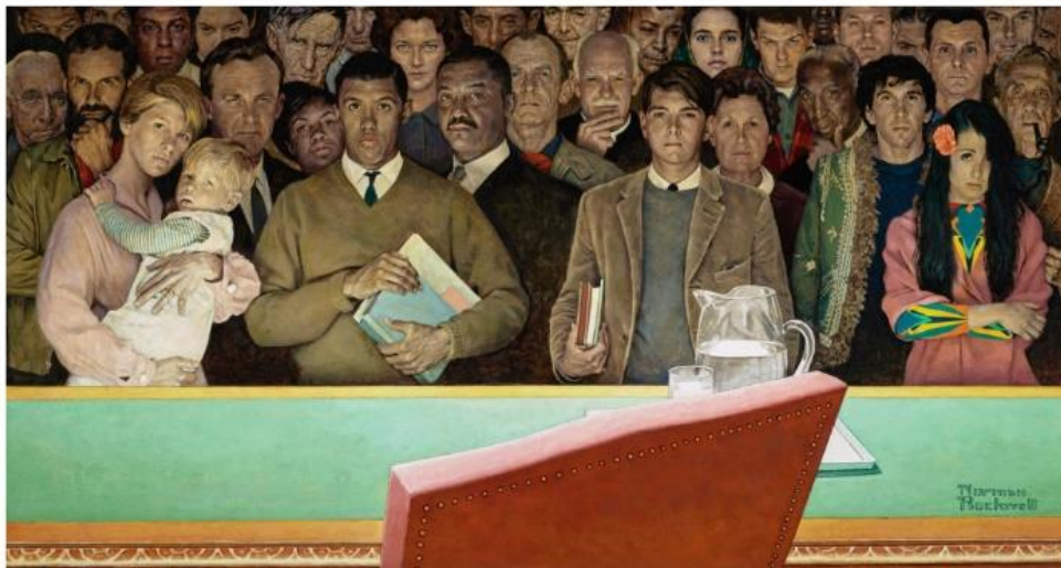
NORMAN ROCKWELL MUSEUM

Inspired by "The Right to Know" (1968) by Norman Rockwell, this mural was painted on a public wall, in a school, for a reason.